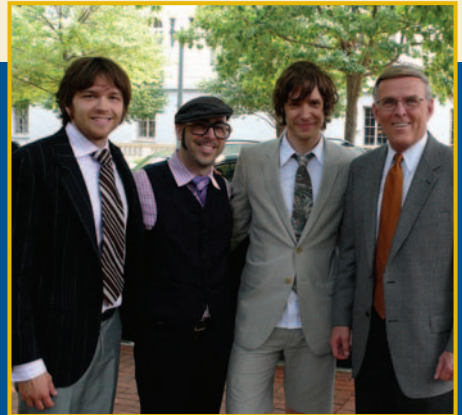
OK GO MEETS WITH SENATOR DORGAN TO DISCUSS NETWORK NEUTRALITY.